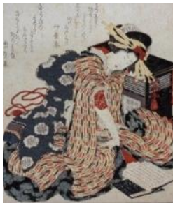
Katsushika Hokusai "Young Woman Reading Makura no Sōshi (The Pillow Book)"

※High quality rouge shined with green colour. Sasabeni rouge made women's lips faintly red. But applying tickly it made their lips green.