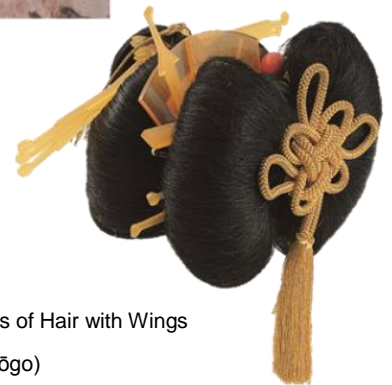
Mountains of Hair with Wings (Yoko Hyōgo)