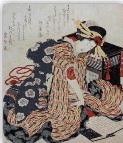
Katsushika Hokusai "Young Woman Reading Makura no Sōshi (The Pillow Book)"

↓ Please click above image and enjoy beautiful movie. ↓