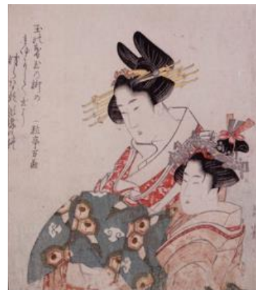
Katsushika Hokusai "Courtesan and Her Young Attendant"

It's typical courtesan hair style "Yoko Hyōgo"