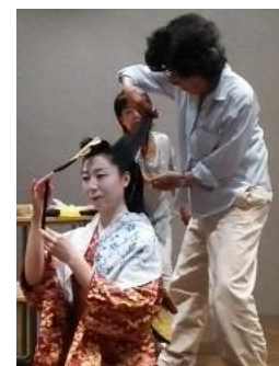
※Hair dressing demonstration

Admission: Free (However, an admission ticket or annual pass is required)